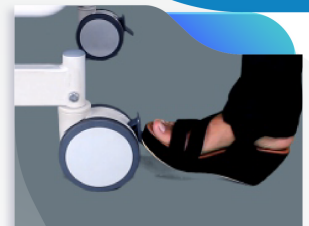
Total Lock Caster Wheel