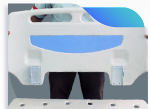
Removable Head & Foot Board