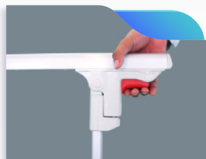
Lockable Side Rail