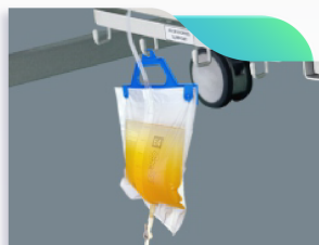
Urine Bag Hanger