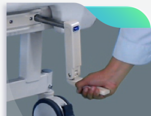
Torque Release Crank